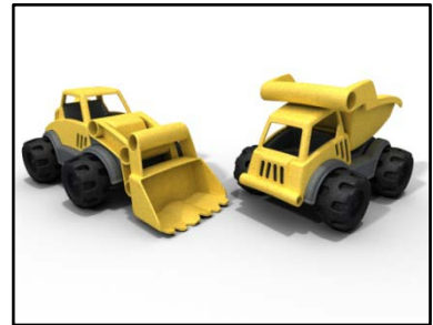
The 2010 Eco-Trucks will feature a new design and lower price point ($7.99 SRP). For Ages 3+

To learn more about Sprig's products or to make an appointment for Toy Fair, please contact Tami Kelly at (925) 640-9997 or tami@sprigtoys.com .